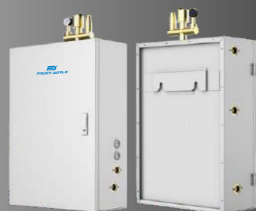
Safer and Durable

Power World's Hydrobox makes heat pump installation and maintenance easier. Hydrobox integrates water pumps, small expansion tank, valves, safety components, electric heater, and other components. When installing the heat pump system, the installer can connect the heat pump directly to the Hydrobox, which is very simple and convenient, even if you do not have a lot of experience, you can follow the instructions to complete the installation.